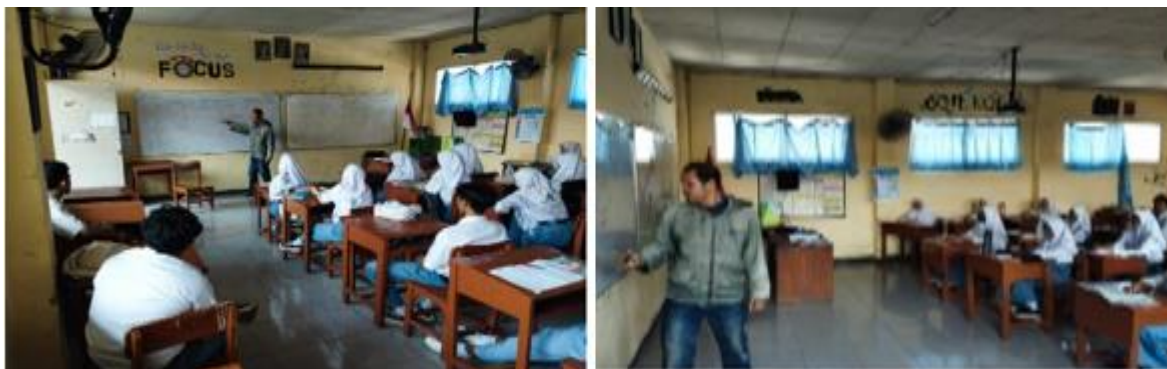
Picture 2. Presentation of material